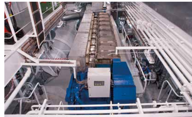
The main engine has reserve power for the ship's ice class notation