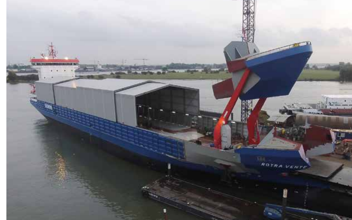
The ship can be loaded in eight hours, regardless of weather conditions

Concordia Group's core business is designing and building vessels with an innovative and economical profile. Their designs combines clients' wishes with high level technical knowledge and their down-to-earth-management allows them to build these vessels worldwide. They also provide turnkey shipping projects, through vessels completely built and managed by Concordia Group.