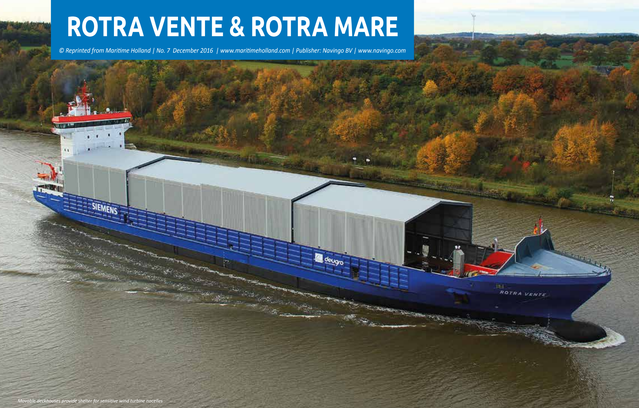
Movable deckhouses provide shelter for sensitive wind turbine nacelles

The short sea shipping and container shipping markets are in a crisis. While in the Netherlands several ship owners have filed for bankruptcy recently, elsewhere in the world a record was broken with the sale for scrap of a container vessel, which was only ten years old. At the same time, the overcapacity of ships in this segment creates opportunities. While versatility was the trend only a few years ago, the tendency has now shifted to very specialised vessels, tailored to do a specific task in the most efficient way.