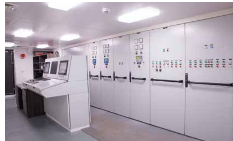
Holland Ship Electric did the complete automation and electrical installation