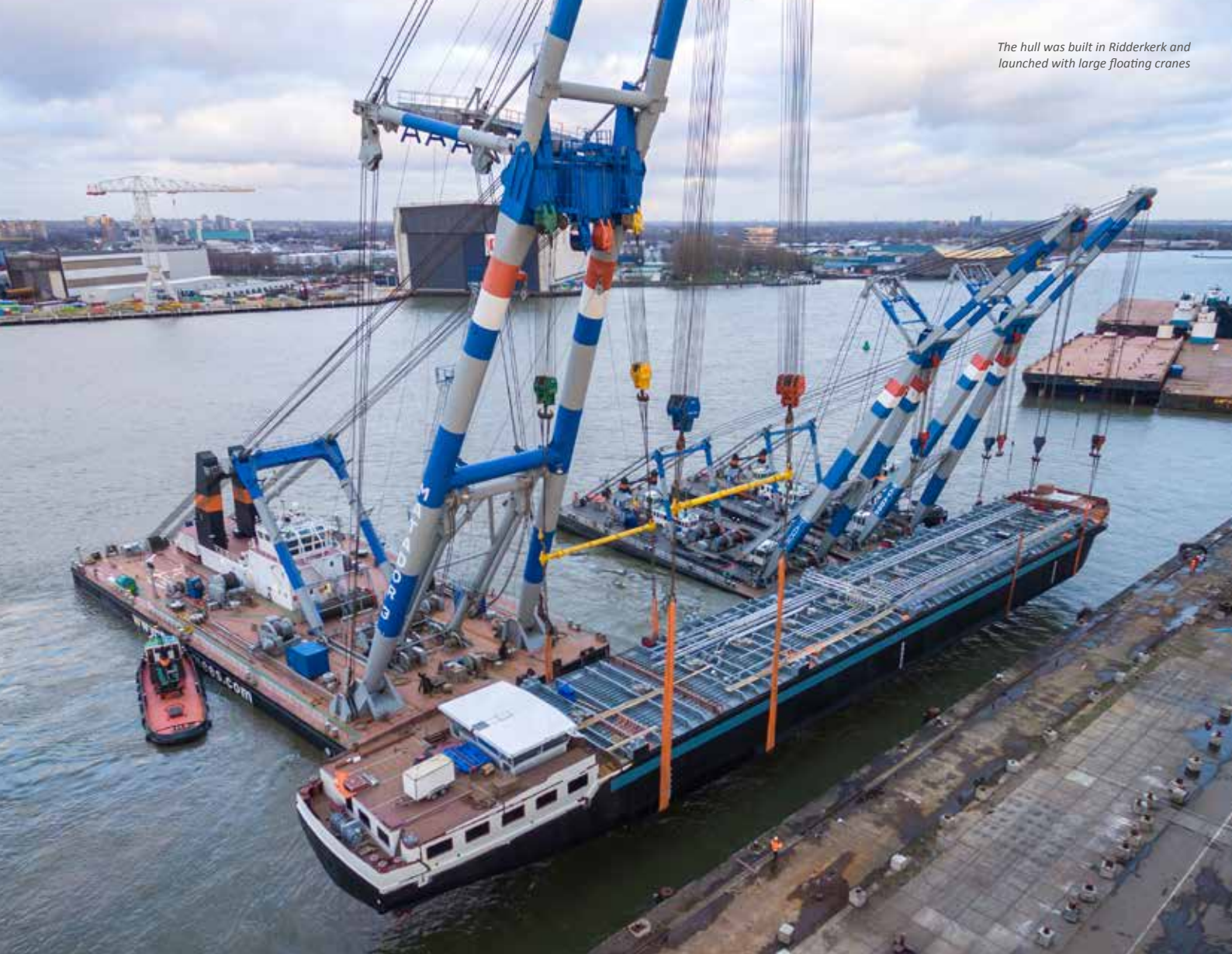
The hull was built in Ridderkerk and launched with large floating cranes

operational profile (constant speed and displacement), but this is actually not true. The difference between sailing upstream fully loaded and downstream empty is huge, so for 50 per cent of the sailing time, the vessel is sailing off the design point. Add to that all the time spent maneuvering (locks, harbors, etc.) where diesel-electric is clearly beneficial. Furthermore, the cargo pumps require a significant amount of electrical power, and a diesel-electric plant allows us to use the same engines for these kind of operations.”