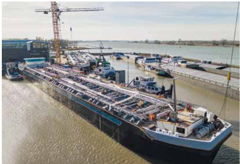
Outfitting was done in Werkendam at Concordia Damen Shipbuilding