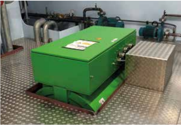
The permanent magnet propulsion motors ensure high efficiency at partial loads

mess room. A crane and stowage position for a car is provided. The entire wheelhouse and its roof can be lowered to reduce the draught of the vessel to only 5.2 metres. The wheelhouse was built by Kampers, and the navigation and communication equipment supplied by Radio Holland and installed by Oechies Electrotechniek, the parent company of Hybrid Ship Propulsion.