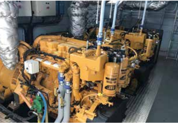
A power management system ensures gensets run properly loaded